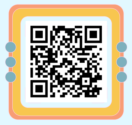
Visit the Barossa Fun Factory Website via the QR Code

A reminder that we have an early departure and a late arrival back to OSHC.